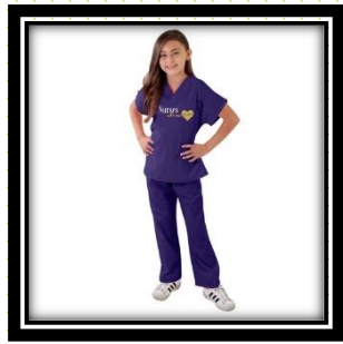
Kids Purple Lab Coat $30.00