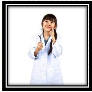
Kids White Lab Coat $20.00