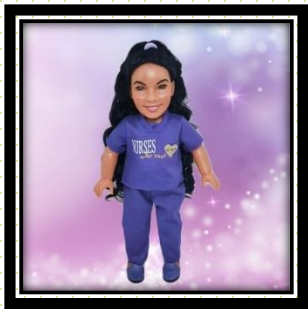
Nurse T Doll $80.00

Our mission is to expose children to health care and entertainment during playtime that allows creativity, expands the imagination, encourages real play, and assists in developing essential life skills. We create the books, dolls and games which create experiences.